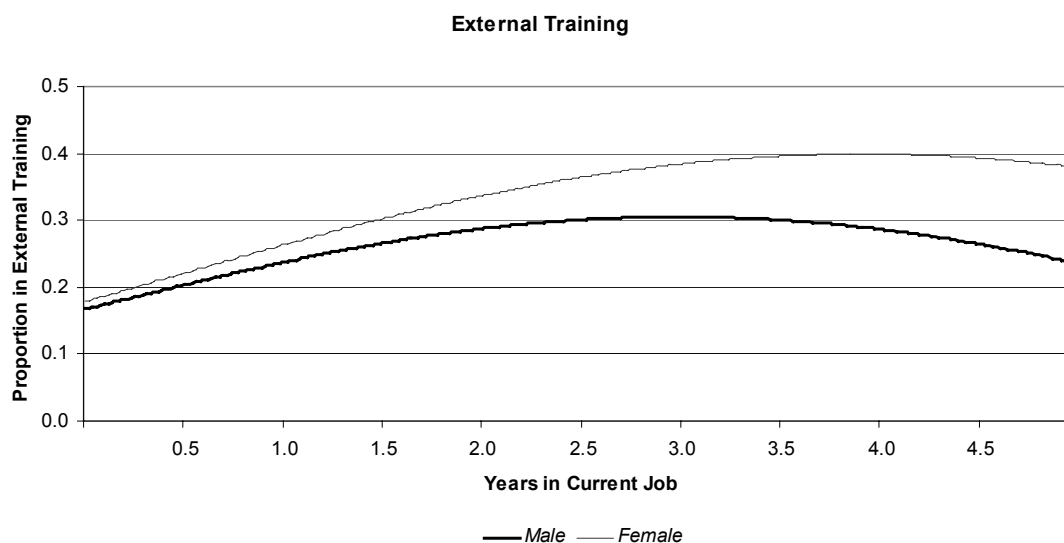
Figure 2 Participation in external training by years in current job and gender