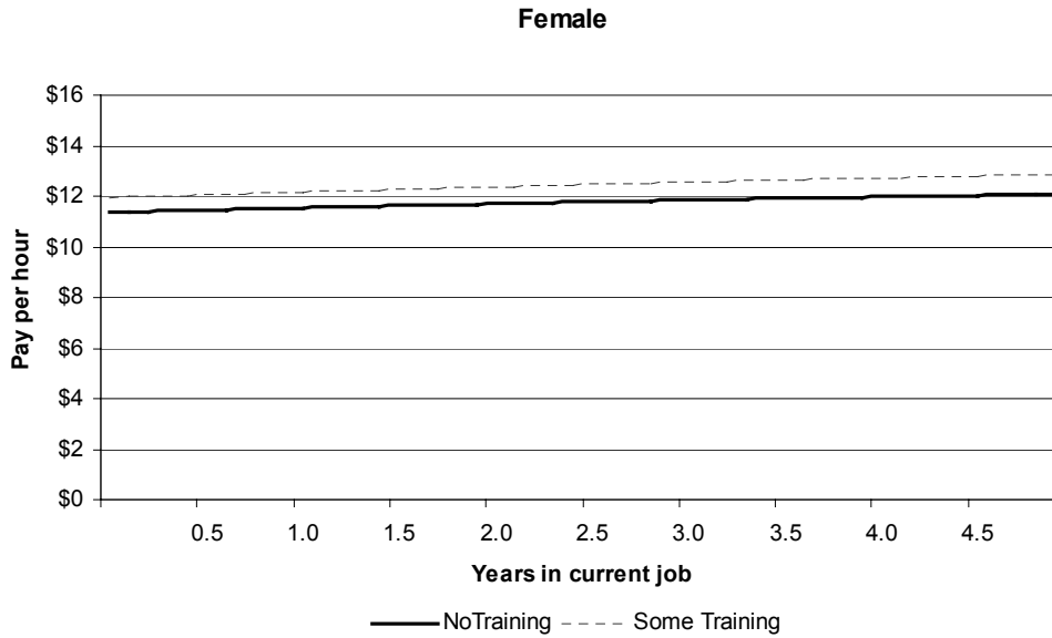
Figure 4 Earnings per hour by tenure: Female employees with and without training