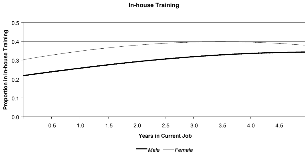
Figure 1 Participation in in-house training by years in current job and gender