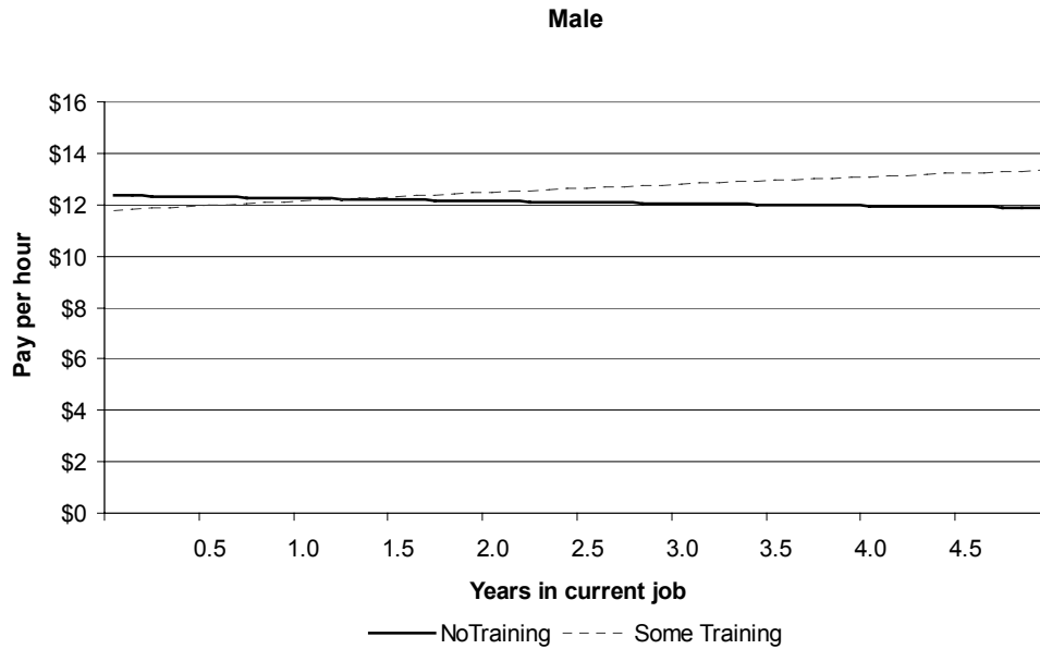
Figure 3 Earnings per hour by tenure: Male employees with and without training

Explanation 2. There are rapidly diminishing returns to training. The estimates of the wage effects of training in Tables 7 and 8 are averages. It is possible that the marginal returns to training -- the returns to training the next employee -- are comparatively low, say of the order of only 20% or so. If the average return is much higher than this and the marginal return is 20%, there must be some very high returns to the training of some employees. This is not impossible given the likely complementarity between training and the efficient use of some forms of capital equipment.